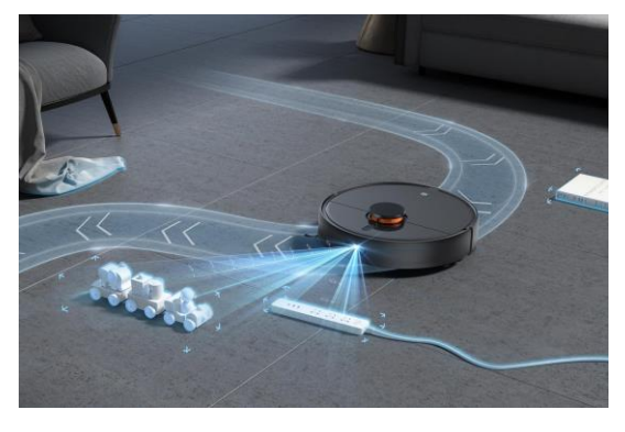
S-cross™ 3D obstacle avoidance technology on It can sense the contours of home obstacles such as slippers and thread balls, and decelerate in advance.