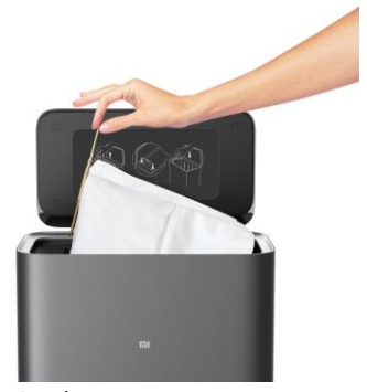
4L large capacity I dust bag*

With strong airflow of 16500Pa, the dust box can be emptied within 10s.