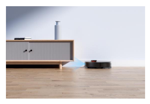
The front-mounted ToF sensor accurately detects spatial data, and evacuates in time when encountering a small space below the height of the cleaner