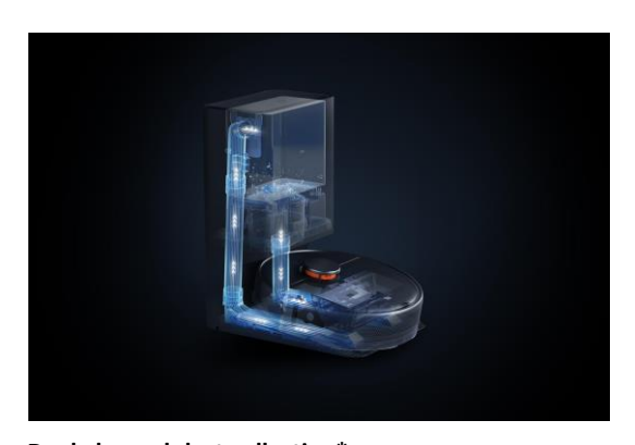
Dual-channel dust collection*

With strong airflow of 16500Pa, the dust box can be emptied within 10s.